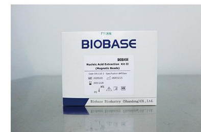
Reagent For BK-HS32/AutoHS96