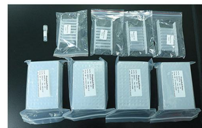
Reagent For BNP32/48