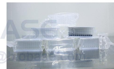
Reagent For BK-HS96